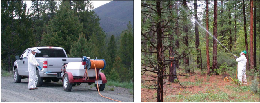
Fig. 1. Bole sprays are commonly used to protect conifers from bark beetles in the western United States.