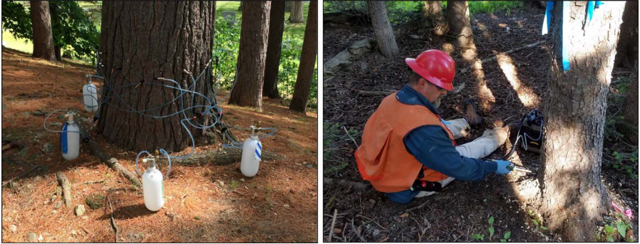
Fig. 2. Recent advances in tree injection offer a viable alternative to bole sprays: Tree IV micro infusion ® (left) and QUIK-jet AIR ® (right) (Arborjet Inc., Woburn, MA). Following injection, the product is transported throughout the tree to the phloem, where bark beetles feed. Injections can be applied at any time of year when trees are actively translocating materials, but time is needed to allow full distribution of the active ingredient within the tree before the tree is attacked by bark beetles.

Southern pine beetle. To our knowledge, no studies have been conducted on the effects of pyrethroids on D. frontalis in the western United States. Limited research conducted in the southeastern United States suggests that 0.5% permethrin (Astro) has longer residual activity than 0.06% bifenthrin (Onyx) (Strom and Roton 2009) (Table 3). In that study, small P. taeda (~9 cm dbh) were sprayed to a height of ~2.5 m and left standing in the field until they were cut for inclusion in a small-bolt assay.